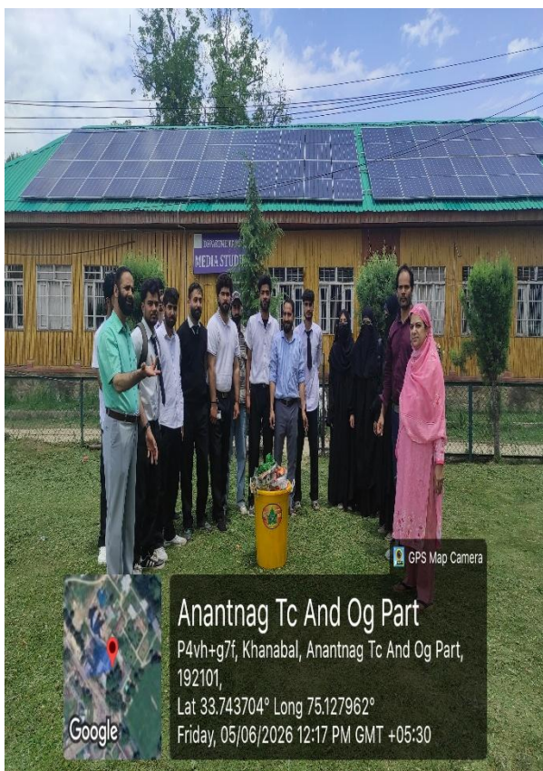
PHOTO GALLERY OF WORLD ENVIRONMENT WEEK CELEBRATION

An educational visit to the Sewage Treatment Plant (STP), Anantnag , was conducted to provide students with practical knowledge of wastewater management and treatment processes. Students observed the operational processes and learned about the importance of wastewater treatment in protecting public health and preventing water pollution.