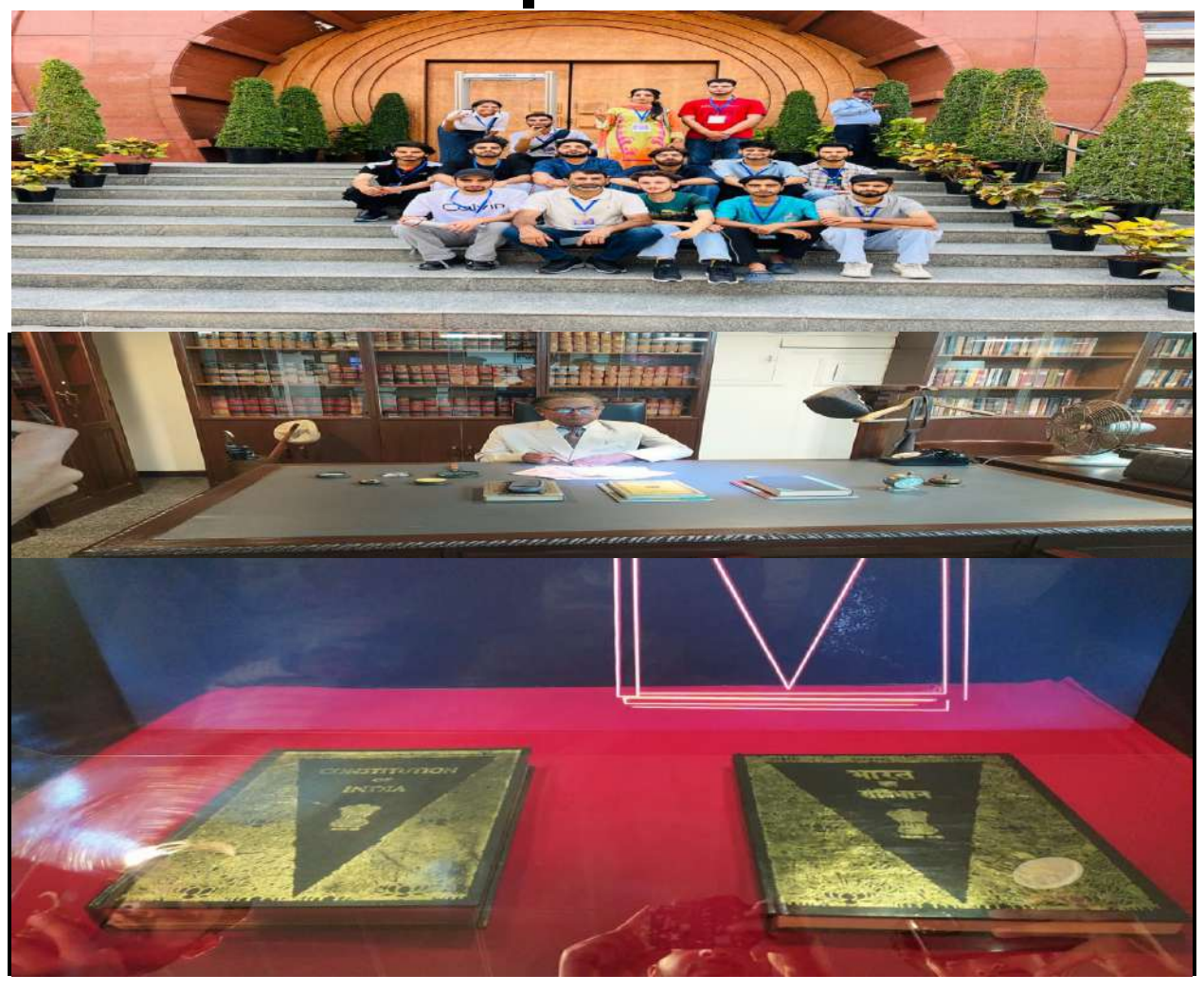
Day 6 october 15:- marked the conclusion of the program with various gifts, mementoes and certificates for all participants. All the members clicked pictures selfies in groups, with each other, the