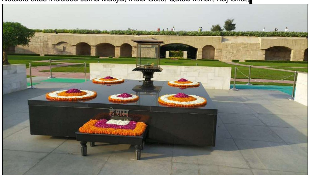
Red Fort, Rashtriya Swachhata Kendra,

Notable sites included Jama Masjid, India Gate, Qutub Minar, Raj Ghat,