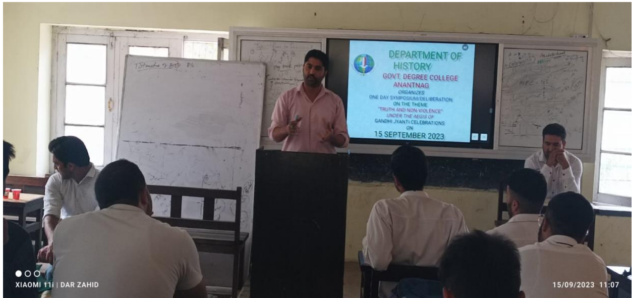
HOD Dept. Of History