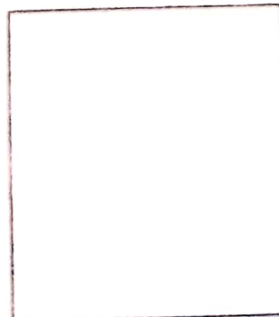
LEFT THUMB IMPRESSION (within Box)